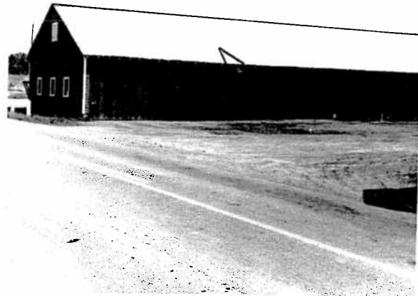
4008 Jockey St.-March 1987