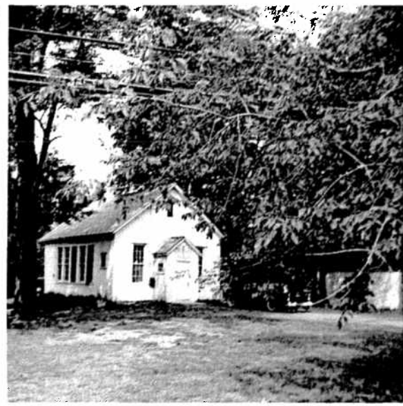
32 Old Route #67 March 1987 Old Stage Rd. 4 Little Troy Lane