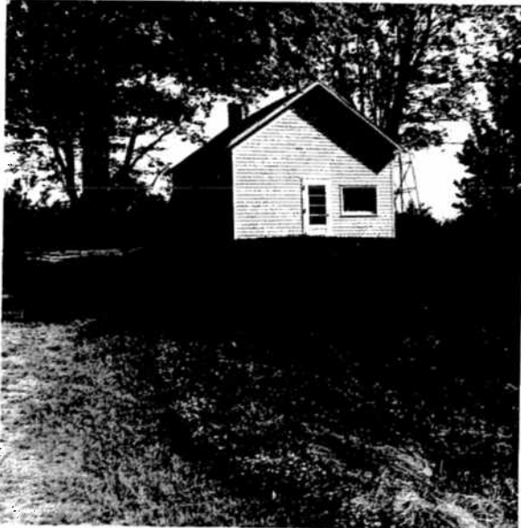
2112 Route #67 May 1987