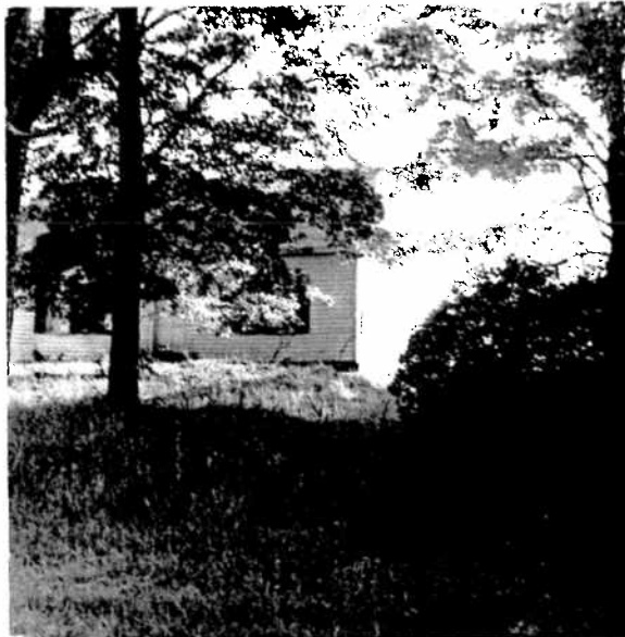
Route #67 April 1987 Jockey St. # 4268