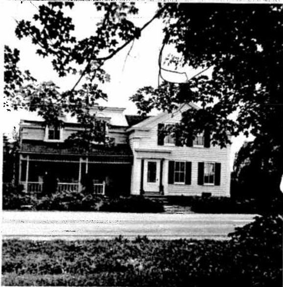
767 Main St.-January 1987