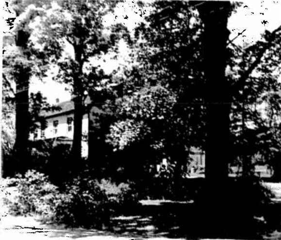
1021 Packer Rd.